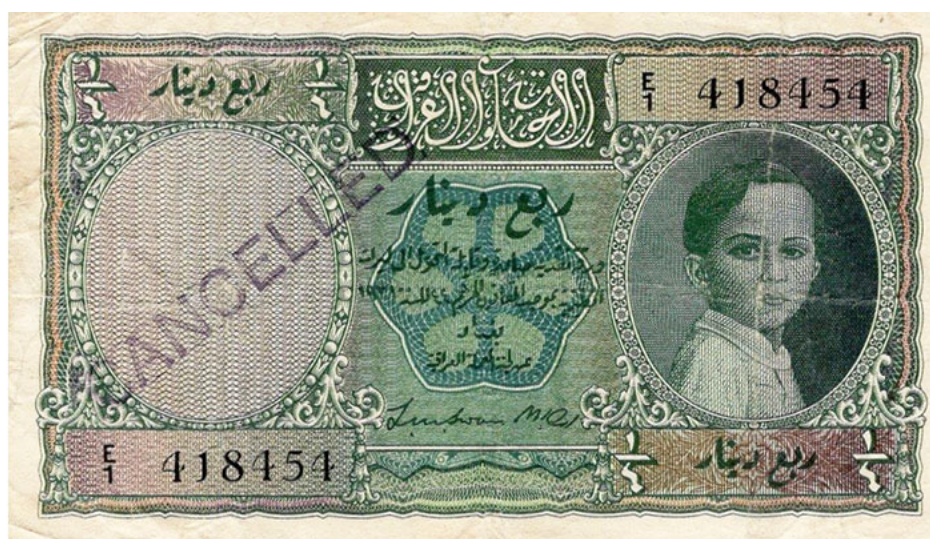
Lot 671: Iraq ¼ Dinar, Faisal II, Indian print. Est. £800-£1000, hammer £2900