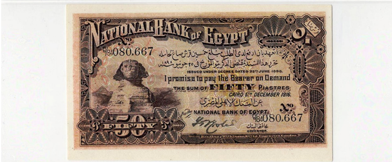
Lot 527: Egypt 50 Piastres 1916, AU58. Est. £5000-£6000, hammer £7600