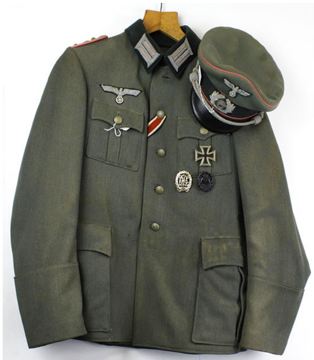
Lot 436: Panzer Officers service Cap & Tunic. Est. £400-£600, hammer £1900