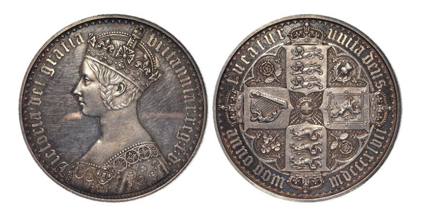
Lots 373: Gothic Crown 1847 plain edge proof nFDC. Est. £8000-£10,000. Hammer £12,000.