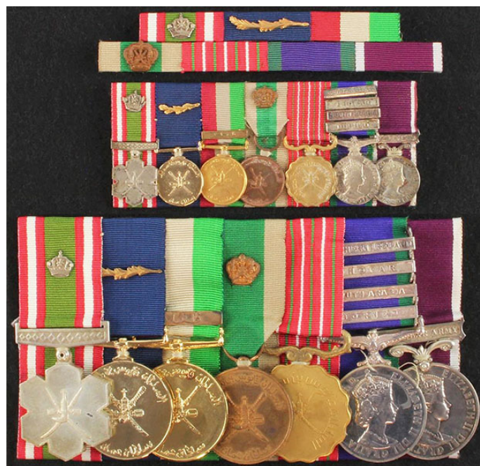
Lots 882: SAS (Oman/Dhofar War) group to P.J. Kysow. Est. £3000-£4000. Hammer £5000.